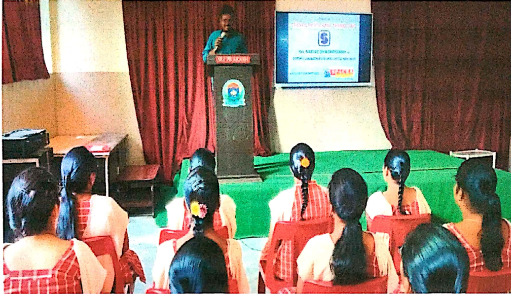
A seminar on “Trends in Pharma Marketing”

( Under the Management of SRI PRAKASH EDUCATIONAL SOCIETY )